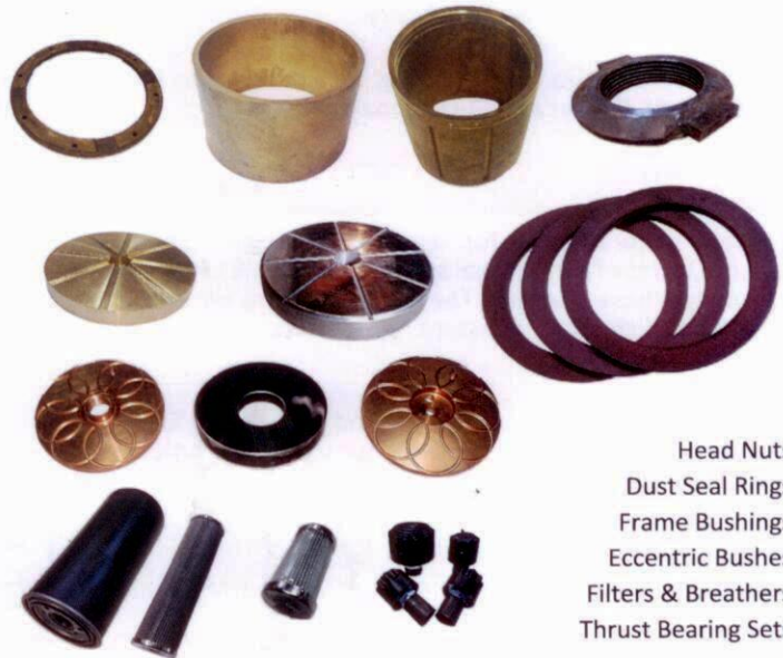
Head Nuts Dust Seal Rings Frame Bushings Eccentric Bushes Filters & Breathers Thrust Bearing Sets