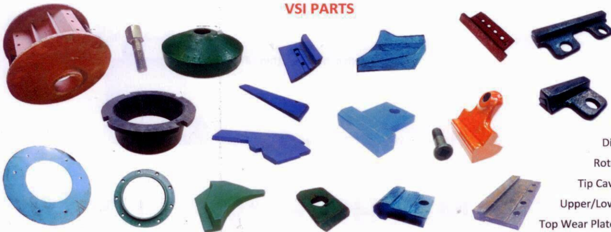
Rotor Tips Back Up Tips Feed Eye Rings Distributor Plates Rotors, Feed Tubes Tip Cavity Wear Plates Upper/Lower Wear Plates Top Wear Plates & Trail Plates

REPLACEMENT PARTS SUITABLE FOR METSO, NORDBERG, SANDVIK, PUZZOLANA, NAWA, TEREX PEGSON, FINLAY, LORO PARISINI, KEUKEN, ECOMAN, EXTEC, PARKER, L&T, BERGEAUD AND OTHERS