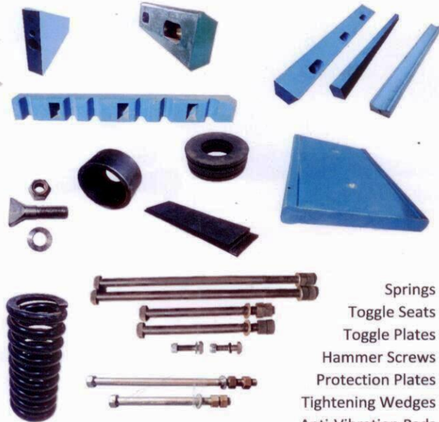
Springs Toggle Seats Toggle Plates Hammer Screws Protection Plates Tightening Wedges Anti-Vibration Pads