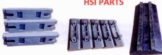
Hammers Blow Bars